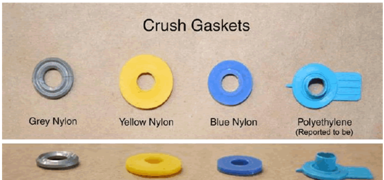
Figure 1 : Examples of crush gaskets available for CGA 870 type medical post valves